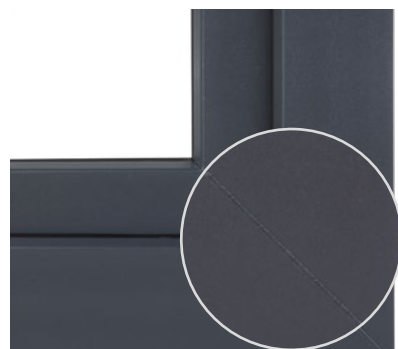
The newest welding technology: P®Perfect