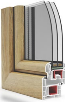
Investline Elegance rounded sash