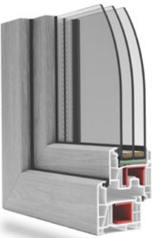
Investline Classic flat sash